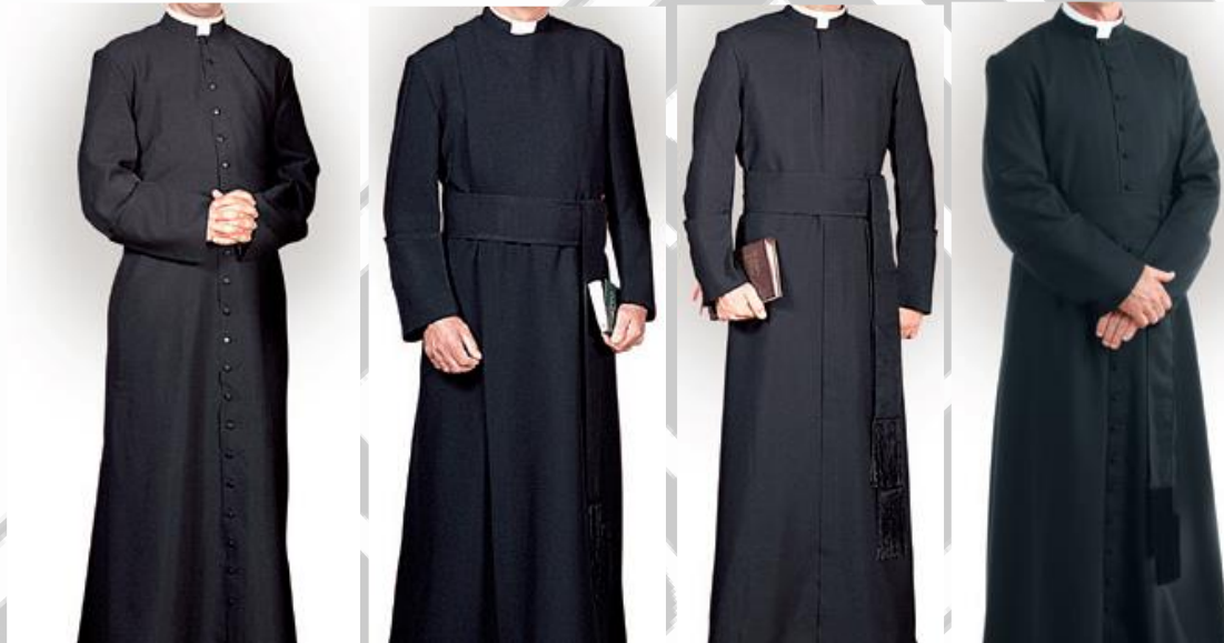
390 & 305